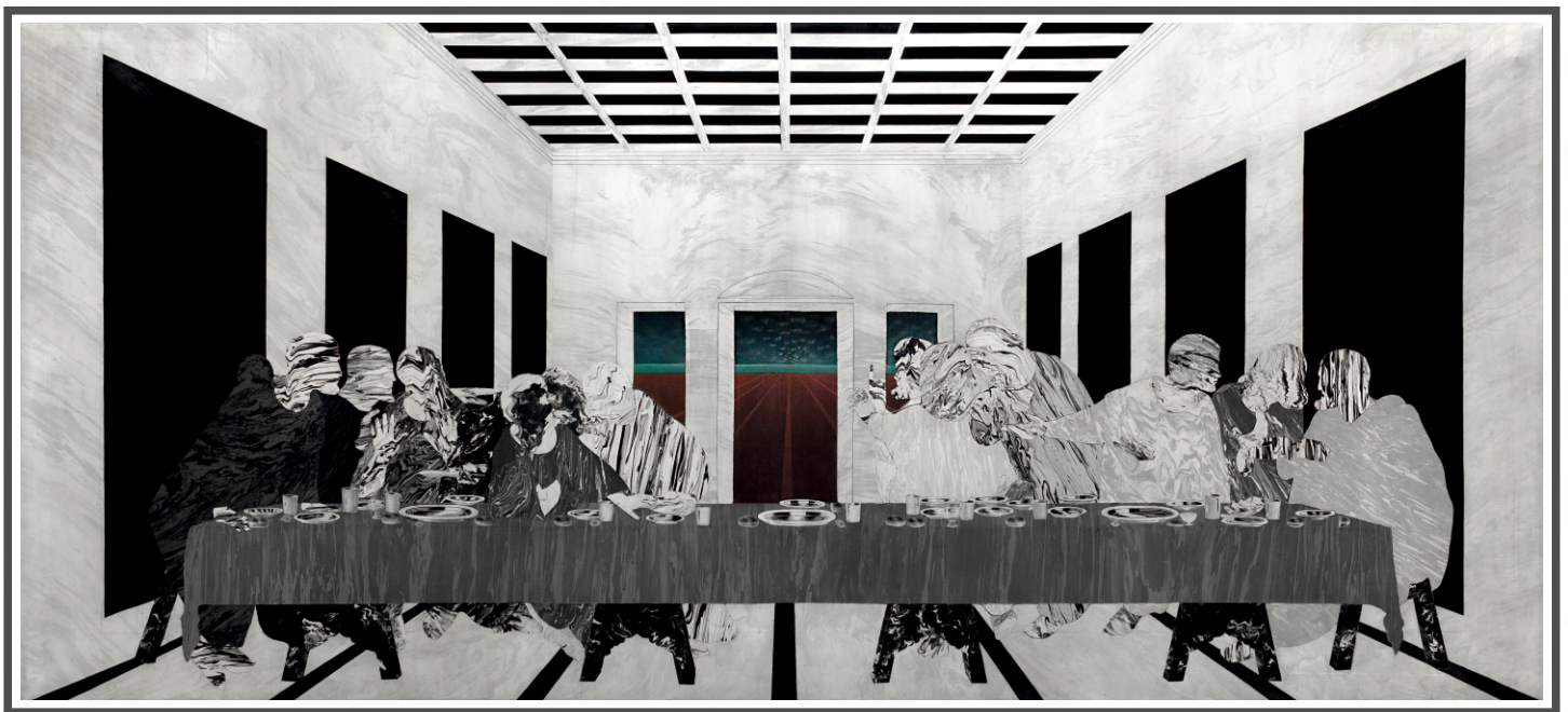
THE LAST SUPPER | Oil and Enamel on Canvas | 81 X 180 inches | 1982-1987